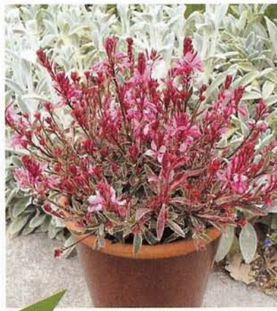
Gaura lindheimeri Bijou Butterflies

habit, and a range of foliage and flower colors. Designers will delight in Bijou Butterflies (12 in.) and Passionate Blush and Crimson Butterflies (each 18 to 24 in.) for long flowering performance alone or in the center of a combo.