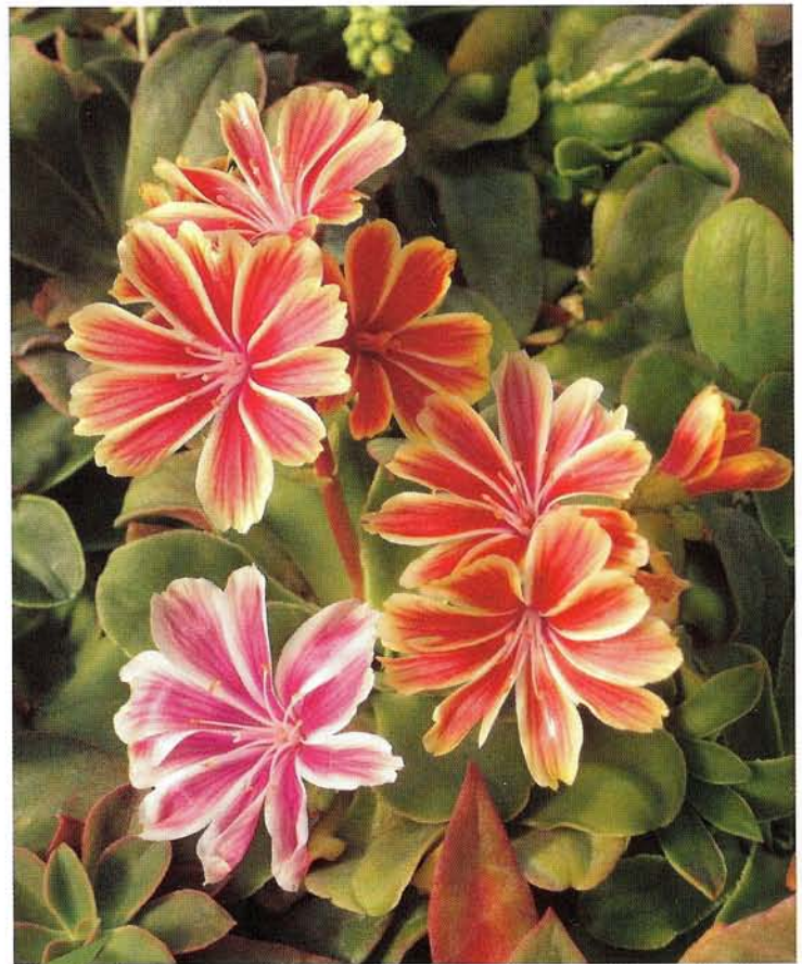
Lewisia Rainbow Mix

Lewisia cotyledon (bitterroot) epitomizes plants that get more respect abroad than at home. In Europe, it’s a dual-purpose “windowsill-to-garden” plant for small (4.5-in./12-cm) pots. Despite its diminutive size (6 to 12 in.), it’s tough, with show-stopping striped flowers, mostly pastels, rising from neat