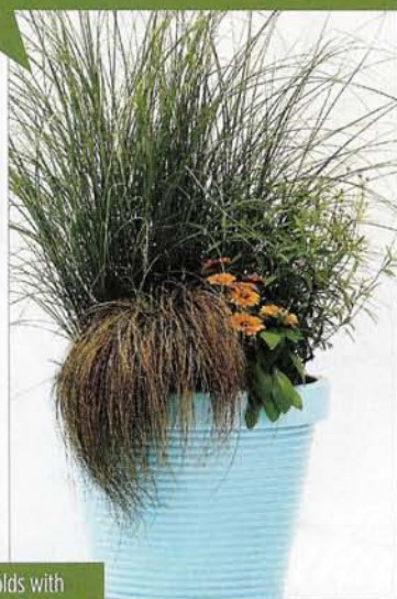
Miscanthus sinensis Gracillimus, Carex flagellifera Toffee Twist, Rudbeckia hirta Tiger Eye Gold (native), Coreopsis Moonbeam (native)

"Typical combinations use high-contrasting plants, like golds with reds and purples. I wanted to pair gold and green. The gold foliage of duranta with the gold stripes on the miscanthus. Bright yellow centers on the echinacea tie in the theme. Again, a monochromatic scheme suggests a modern look."