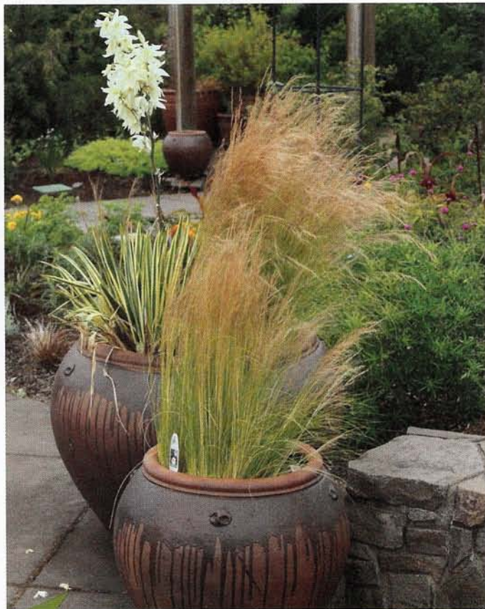
Nassella tenuissima's fine-textured plumes are a graceful sight during breezy days.

In a pot, P. subulata makes a fine understory for Eragrostis elliottii , a blue-green, narrow-bladed grass native to Georgia and the Carolinas. "Love grass" forms graceful mounds topped with delicate tan flowers in summer.