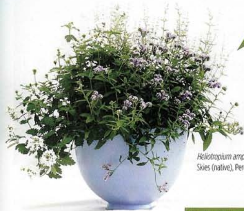
Heliotropium amplexicaule Azure Skies (native), Perovskia Little Spires

"Let the shape of the container inspire you. This low, round, open bowl shape has an old-fashioned feel. I wanted to saturate it with foliage and small blooms. I used a more monochromatic approach to make it a bit more updated."