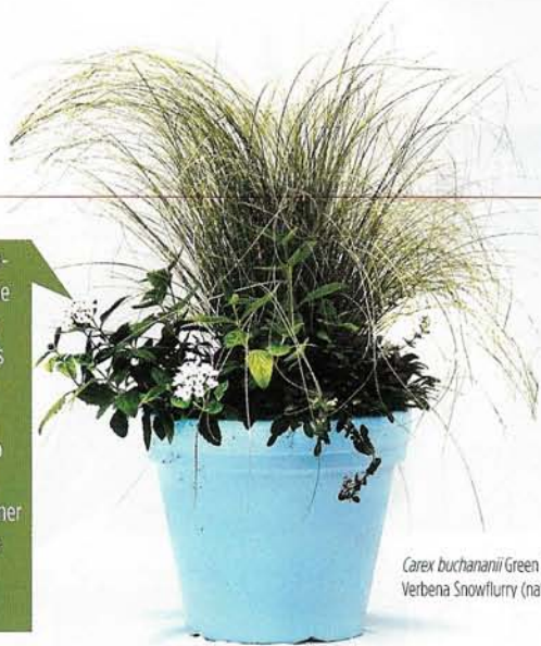
Carex buchananii Green Twist, Verbena Snowflurry (native), Ajuga

"This one is a more modern presentation with the understated green color throughout. Its subject is the contrasting texture: The fine blades of the carex juxtaposed next to the larger leaved ajuga. The verbena offers another leaf texture and adds an attractive, soft white flower."